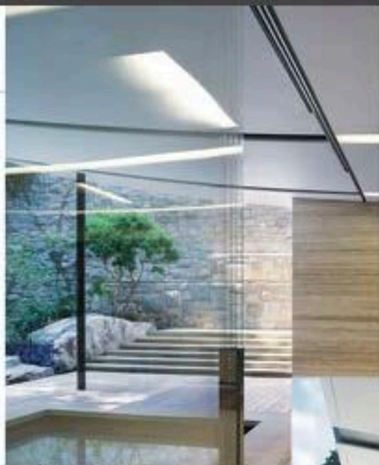
(previous page) The 20-yard long lap pool. (this page, clockwise from top) the gym looks out to the landscape; the pool, the gym and spa are built underneath the cantilevered tennis court; the serene interior.

Not only is the Monaco Drive gym and spa a perfectly shaped space, it's one with a strategy. Smart looking, it is elegantly sparse but not severe, an inviting place to be and to move. And, in conjunction with its components and contemporary thinking, it puts more weight on the importance of designing a well-rounded fitness facility at home. After all, the more appealing the space, the more motivation one has to use it. kaadefgroup.com